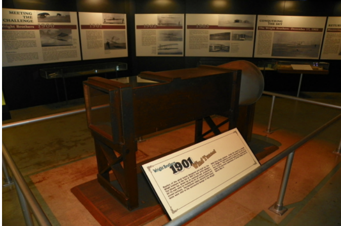
Wright Brothers Artifacts—Including one of their bicycles and an early wind tunnel